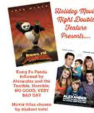
Movie titles chosen by student vote!